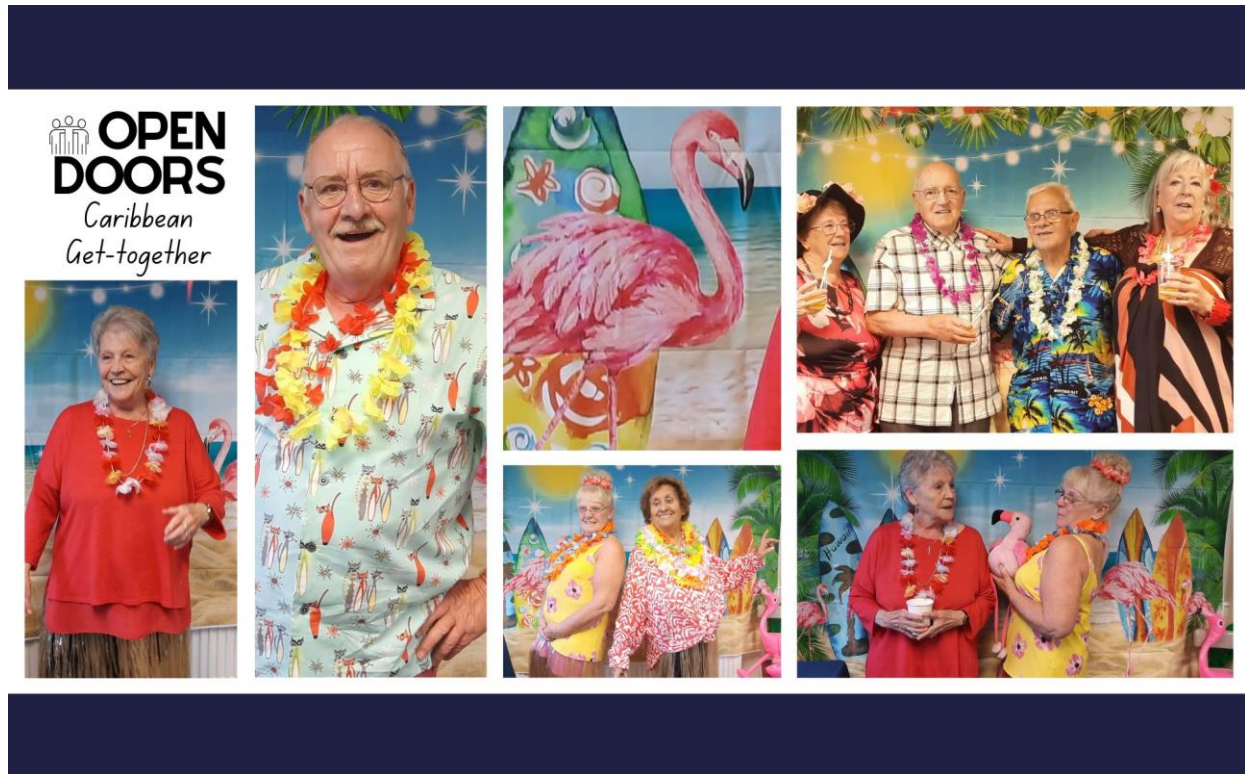
Open Doors Caribbean themed get-together

Occasionally we do have events, such as pancake day or Christmas Carols, occasionally a birthday celebration and our regular guests feel important when we treat them. One of the roles of Open Doors is bridging the gap between Church and the world; these events can really help with that. Just for encouragement we also have get togethers for the team, usually for a meal, although last year we decided to theme our get-together “Caribbean.” The weather was more like the Antarctic, but we had so much fun indoors. In January we had a post-Christmas meal together.