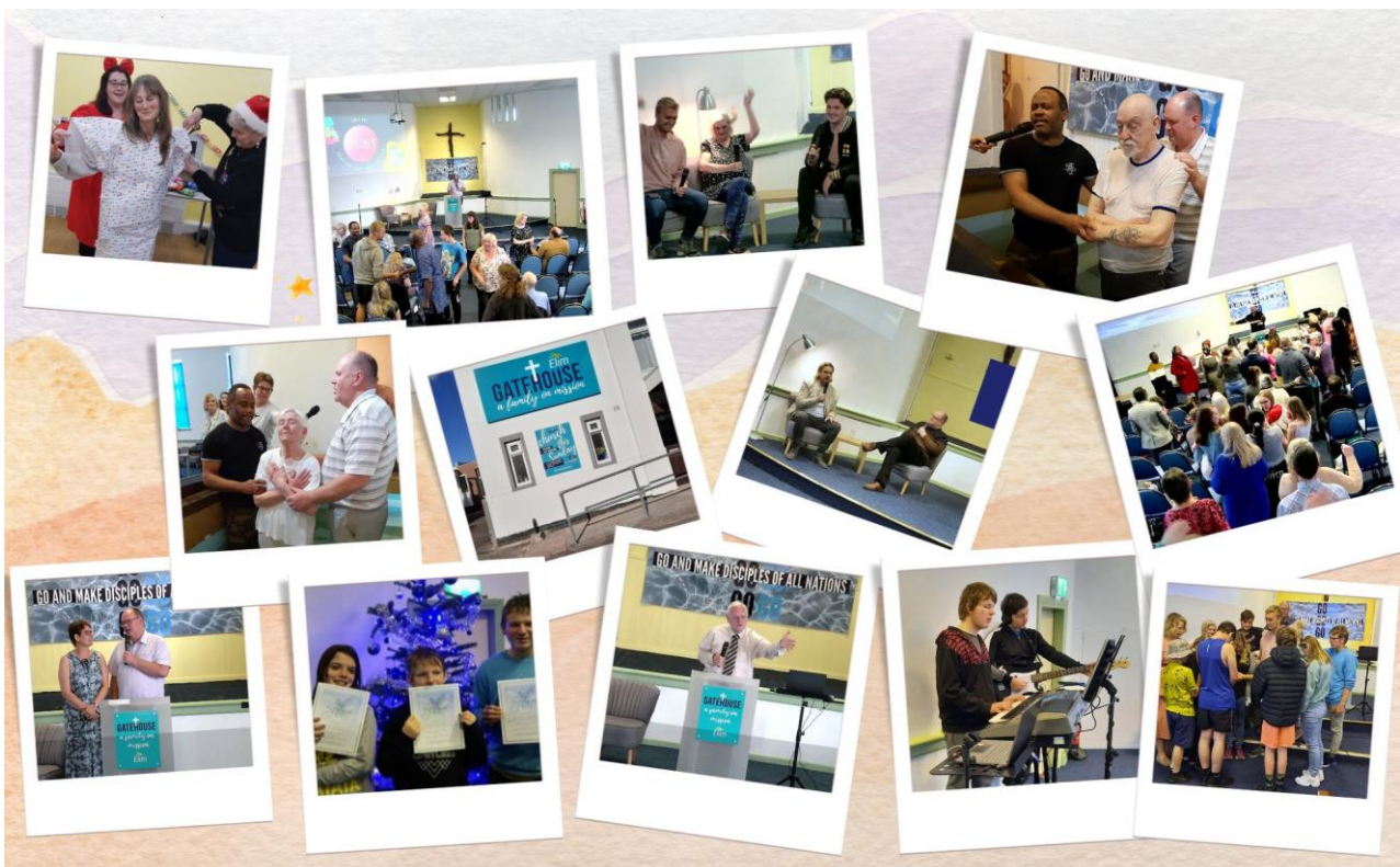
A Family on Mission!